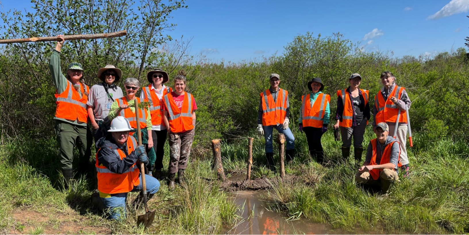
Canaan Valley National Wildlife Refuge volunteers pose during construction of a new beaver dam analog.